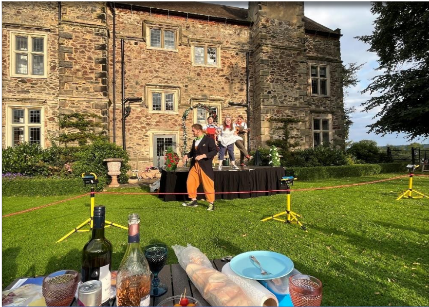
The Pantaloons performing Alice in Wonderland at Osgathorpe Hall