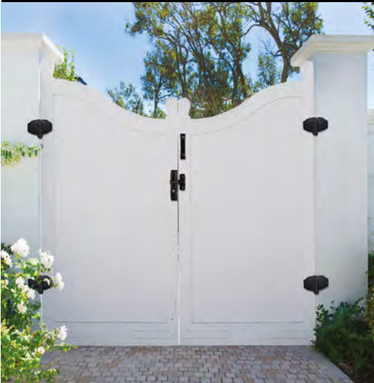
LokkLatch ® Deluxe

World's most trusted gate latches, locks and hinges