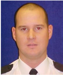
PC 1391 COLEMAN